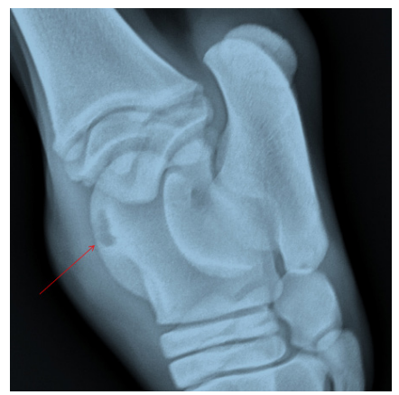
Figure 4 Infection in bone of hock. The red arrow shows the area of bone damage

itself is infected, there will be effusion (increased fluid) in the joint evident as bulging of the joint capsule. There might be swelling of the adjacent tissues. The foal will usually have an elevated temperature and might also appear depressed and inappetent, although these symptoms are