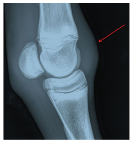
Figure 2 Fetlock x-ray showing joint swelling (red arrow)

There are a few predisposing factors, but the most important one is partial or complete failure of passive transfer. All foals are born without an effective immune system or circulating antibodies to fight infection. As such, they rely on being able to ingest the first milk - colostrum - within a few hours of birth from their dam. Colostrum contains concentrated antibodies from the mare's circulation