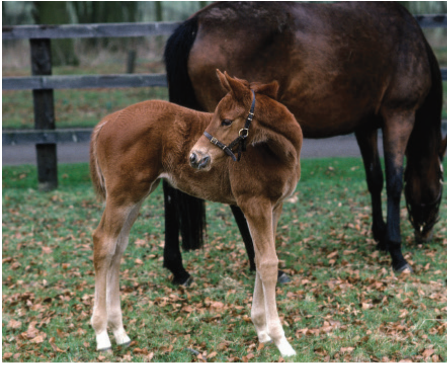
Foals are most susceptible to joint ill during the first 21 days of life

This alone might make the foal very ill (septicaemia) and is, in itself, a lifethreatening condition. However, in many cases, this bacteraemic phase does not cause illness and goes unnoticed, but the bacteria can localise in or adjacent to one or more of the foal's joint(s), to later manifest as joint ill. The 'seeding' of this infection usually occurs in the growth plate (physis), the adjacent bone (diaphysis or epiphysis, Fig 1), in the bone near the joint surface or in the membrane lining the joint (synovium). It is believed that these sites are predisposed to involvement because of their rich but complicated blood supply and the slowing of blood flow through these regions.