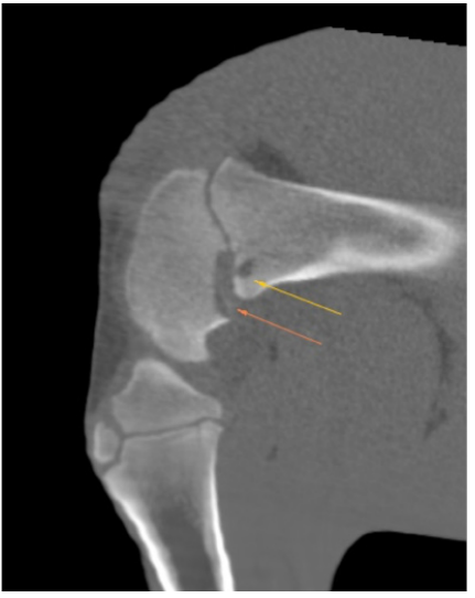
Figure 5 CT image of growth plate abscess (arrows) distal femur (stifle joint)