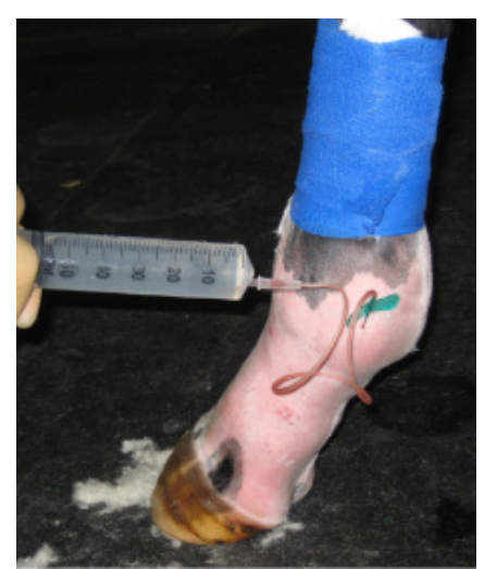
LEWIS SMITH FRCVS

Success of treatment is usually monitored using serial joint fluid samples, assessment of lameness and radiographic reassessment. Treatment can be prolonged and become very expensive