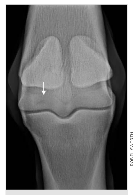
Figure 4 A dorsopalmar flexed view of the right fore fetlock of a three-yearold racehorse. There is a semilunar crescent-shaped lucency in the lateral condyl, indicative of the surface of the cartilage wearing through, allowing resorption of the bone underneath the cartilage (the subchondral bone). This lesion resulted in this horse being rejected for importation into Hong Kong. He continued to race at a high level with great success for a further two years, but there is no knowing what the result would have been had the horse continued his career in Hong Kong

Another of the listed conditions for potential unsuitability for importation is the presence of a bone cyst, but a cyst would not always be a straight rule-out. A discreet cyst, like the one shown in figure