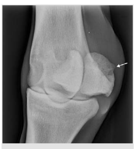
Figure 5 A subchondral bone cyst (white arrow) in the accessory carpal bone of the left knee in a yearling. Whilst this radiographic finding might be of concern in a young horse with its entire career ahead of it, it may well be considered suitable for importation following a proven racing career