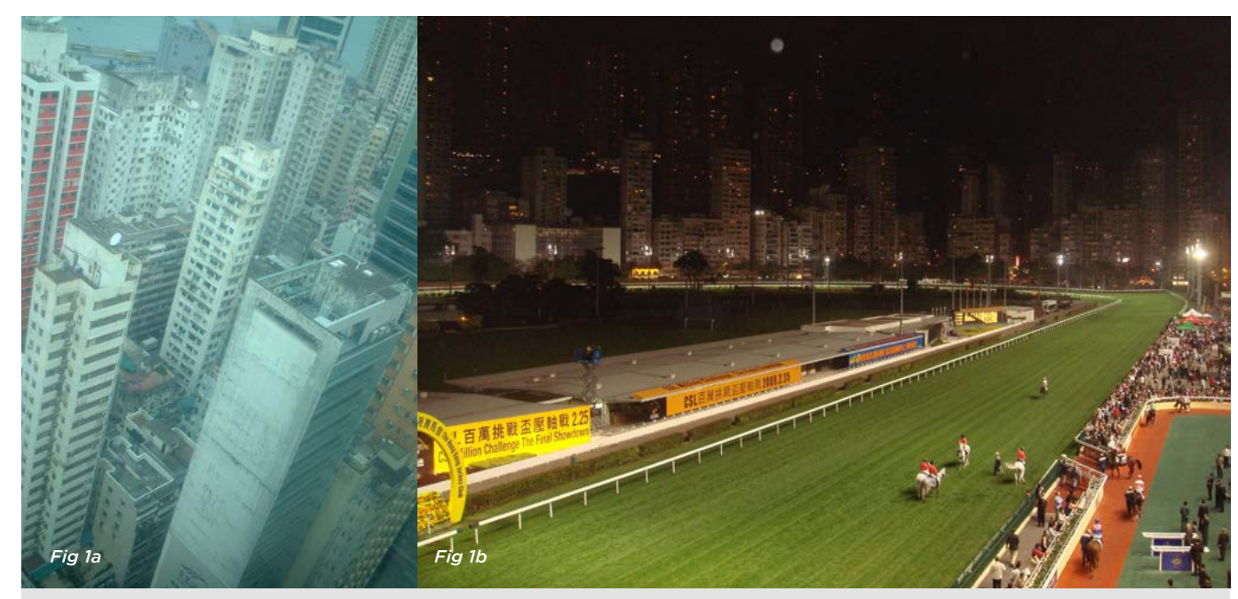
Figure 1 The population and housing density in Hong Kong (Fig 1a) means that racehorses compete directly with people for space. The racetracks are ringed by tower blocks (Fig 1b). Horses simply have to perform, to make the case for racing

Every new season sees more and more horses sold to race in Hong Kong from Europe, but there will be many others who have been targeted but have not passed the region's stringent vetting process, explained here